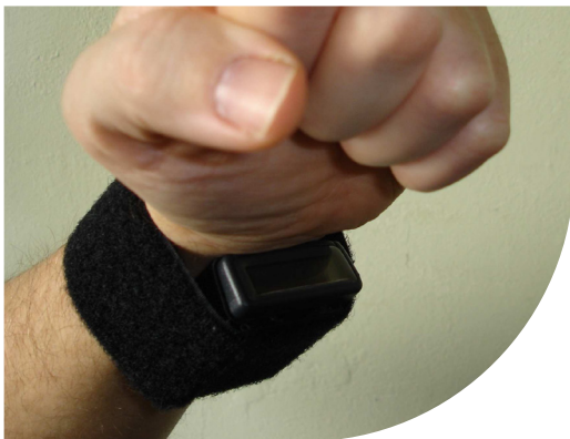
Night time DeafWatch receiver and wrist strap.

Complies with all the relevant parts of BS5839:01 2002, EN54-4, EN 300 224.