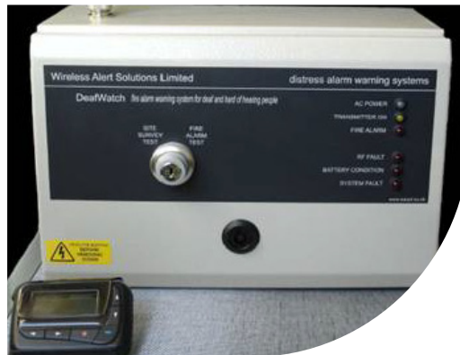
DeafWatch Fire Alarm System and Personal Receiver